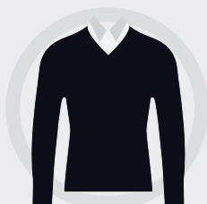
V-NECK PULLOVER *