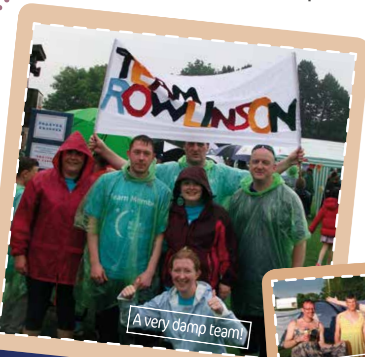
A very damp team!