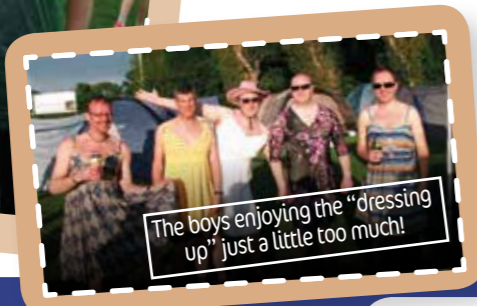
The boys enjoying the "dressing up" just a little too much!